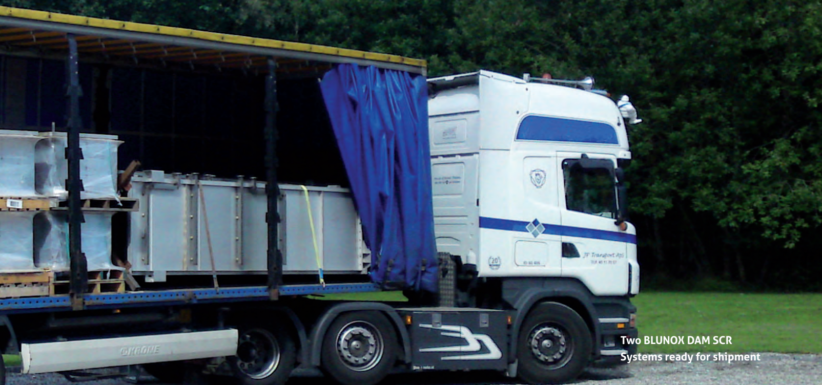
Two BLUNOX DAM SCR Systems ready for shipment